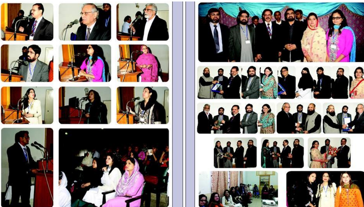
Symposium and workshop on Oral & Maxillofacial Pathology, KEMU, 30 th Nov, 2013, Lahore