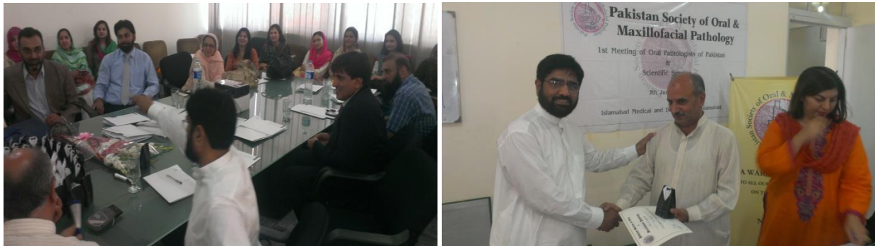
1 st All Pakistan Oral Pathologists meeting and scientific session 7 th June 2014 at IMDC, Islamabad