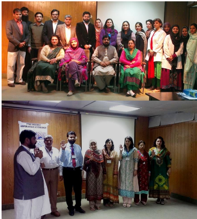
Punjab council Province: Punjab