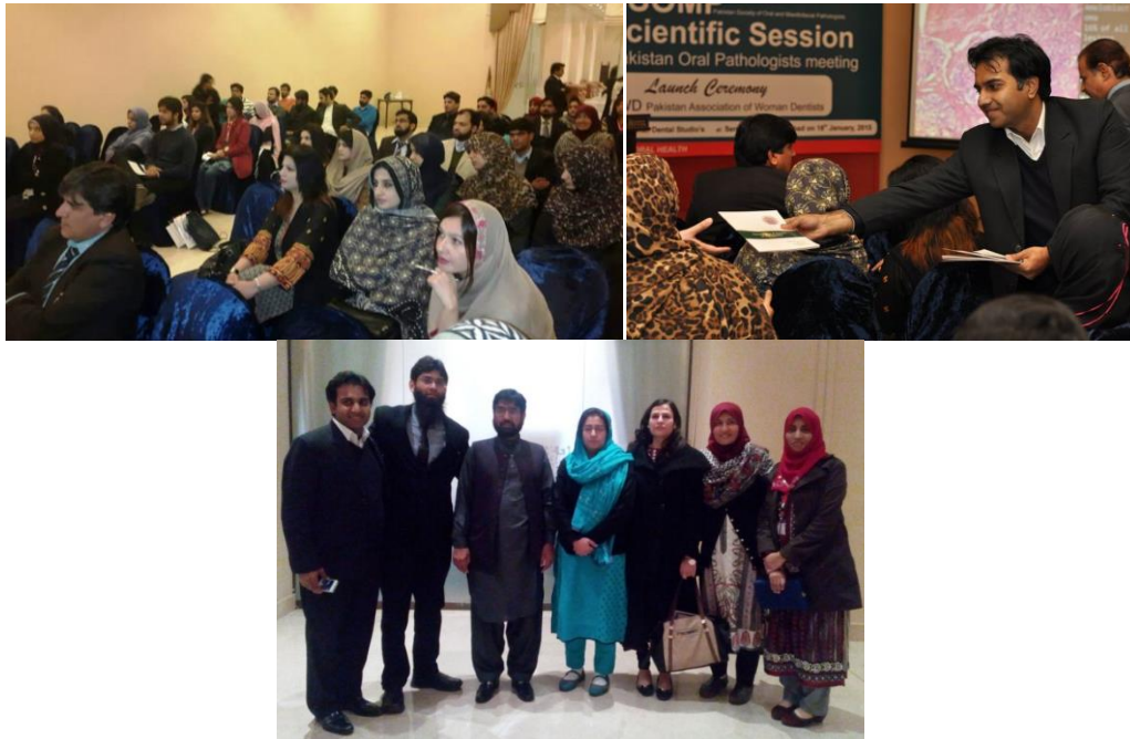
Speakers at the Symposium sharing their research work & Constitution distribution at the scientific session Serena Hotel, Islamabad