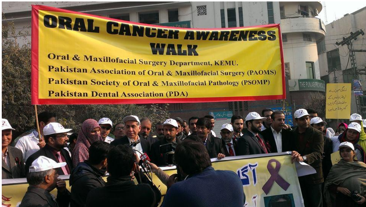
Oral Cancer awareness walk in collaboration with OMS Dept, KEMU, PAOMS and PDA on 10 th Jan, 2014, Lahore