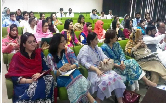
Different glimpses of the symposium, workshop and hands on carried out at SZH, Lahore