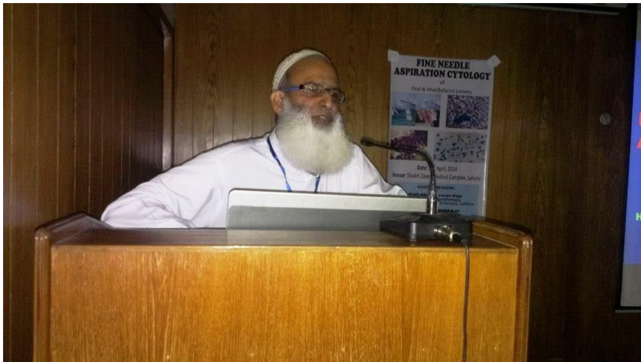
Symposium and workshop on FNAC, 19th April, 2014 at Sheikh Zayed Hospital, Lahore